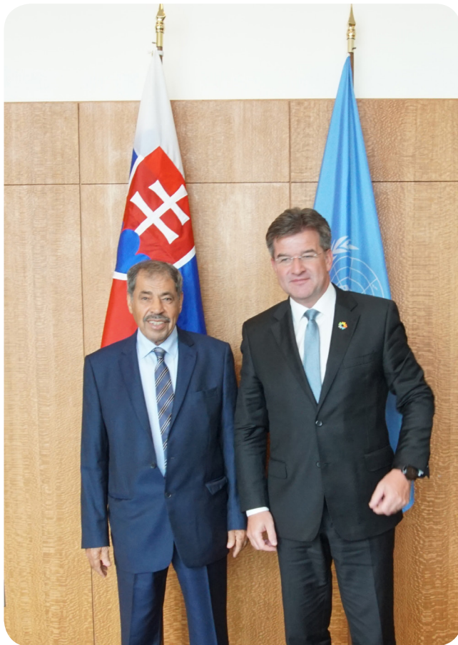
Abdulaziz Saud Al-Babtain with Miroslav Lajčák, President of the United Nations General Assembly at his office. (September 5, 2018)