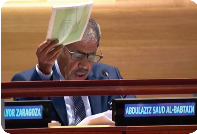
Abdulaziz Saud Albabtain during his speech at the General Assembly of the United Nations, presenting the model manual prepared by the Foundation for the education of Culture of Peace at all levels of education around the world. (September 5, 2018)