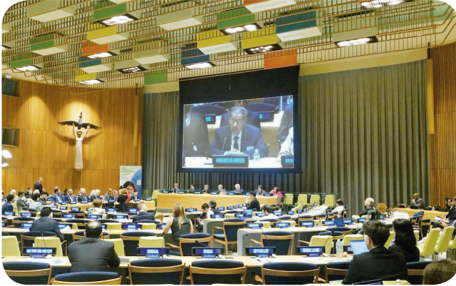
The UN General Assembly High-Level Forum on the Culture of Peace