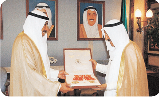
HH Sheikh Sabah Al-Ahmad Al-Jaber Al-Sabah, Amir of Kuwait awards poet Abdulaziz Saud Al-Babtain the Kuwaiti Order of the Sash (First Degree), granted to him by HH Sheikh Jaber Al-Ahmad Al-Sabah (God bless his soul) in 2005.