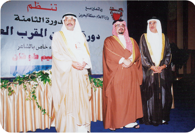
Abdulaziz Al-Babtain with HH Sheikh Salman Bin-Hamad, Crown Prince of Bahrain and Mr. Nabil Bin-Yaakoub Al-Hamar, Minister of Information, Manama 2002.