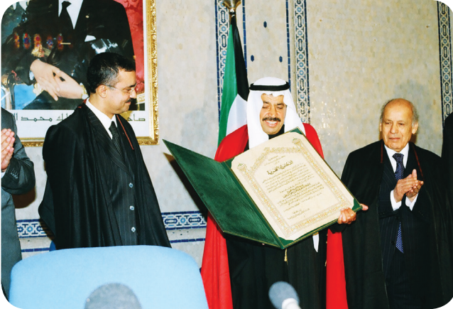
Abdulaziz Al-Babtain receives the honorary doctorate from Prof. Toufik El Ouazzani Chahdi, President of the Sidi Mohamed bin Abdullah University in Fes (15 December 2006)