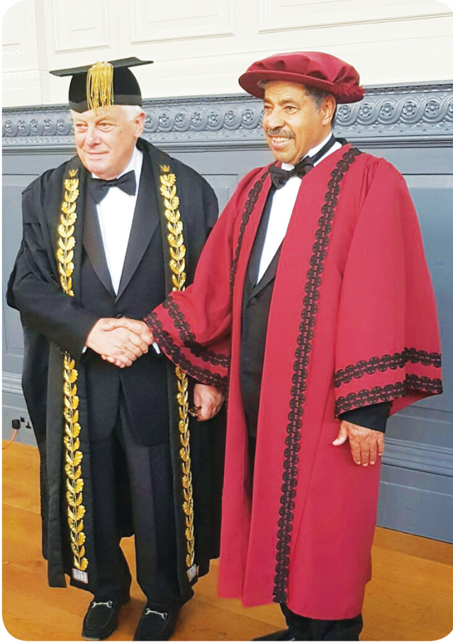
With the Chancellor of the University of Oxford, Lord Patten of Barnes after the celebration of renaming the Laudian Chair- the Abdulaziz Saud Al-Babtain Laudian Chair in Arabic, 15 September 2016.