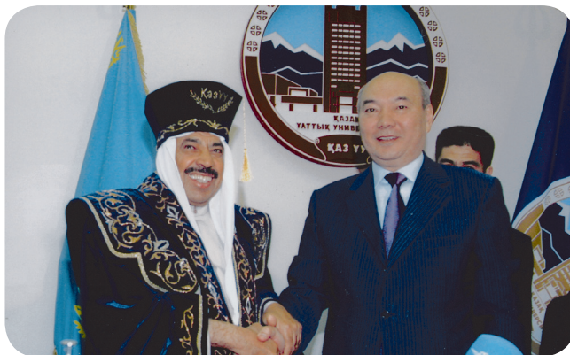
Abdulaziz Al-Babtain with Bakhytzhon Zhmagulov, Kazakhstan's Minister of Education, after receiving the honorary doctorate from Al-Farabi Kazakh National University, Kazakhstan (25 September 2009)