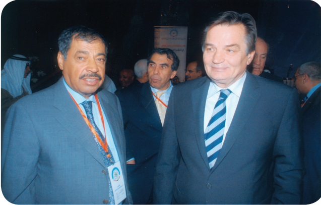
With Former Bosnian President Haris Silajdžić, Sarajevo 2010.