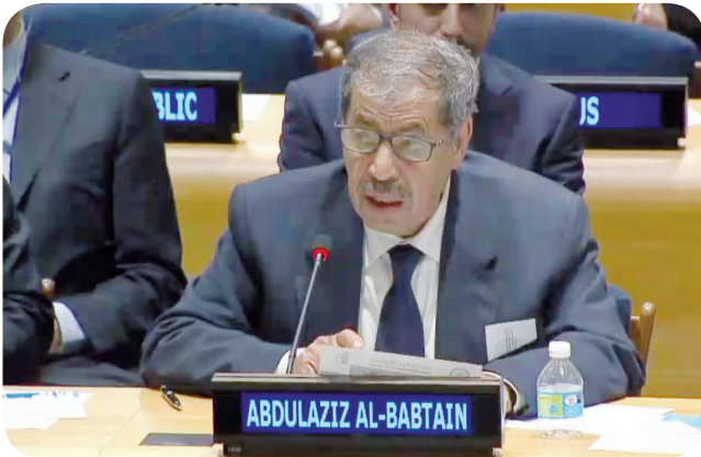
Giving his speech at the second session of the High-Level Forum