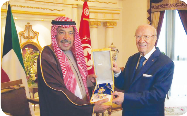
Abdulaziz Al-Babtain receives the higher rank of the “Cultural Order of Merit” from HE Tunisian President Beji Caid Essebsi (27 January 2016)