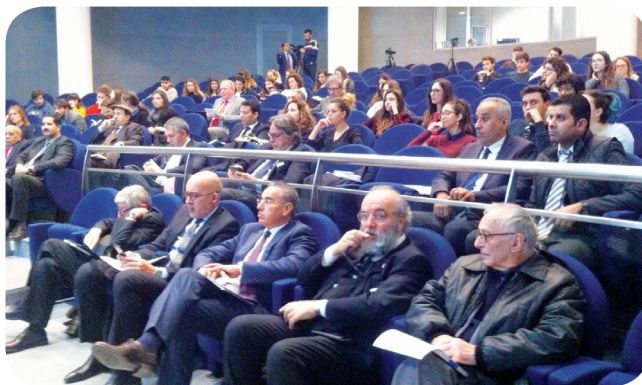
The audience at the opening ceremony of Abdulaziz Saud Al-Babtain Chair for Peace in Europe held on 22 November 2017 at the Great Hall of Roma Tre University.